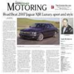
Autos for Sale